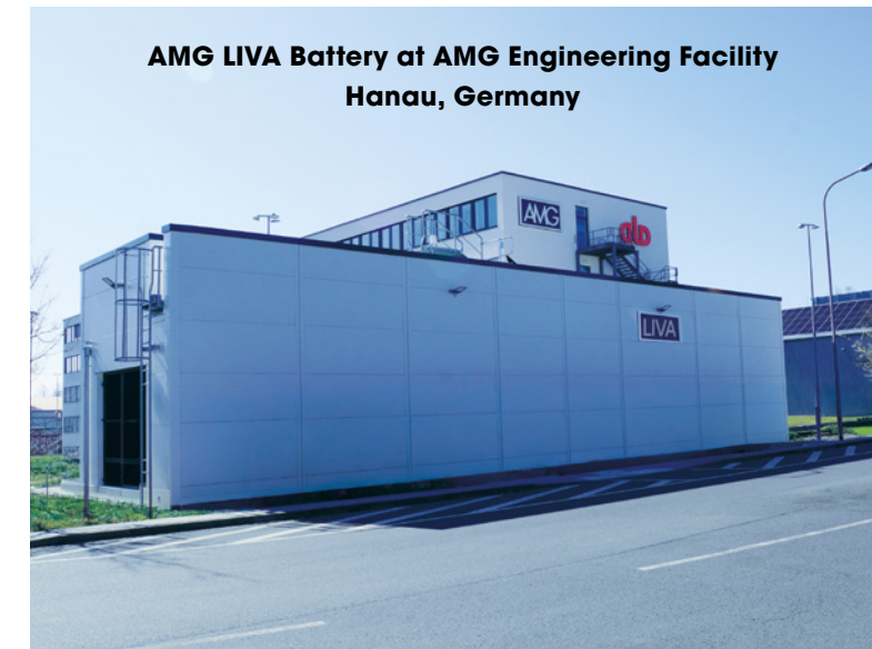
AMG LIVA Battery at AMG Engineering Facility Hanau, Germany

end, AMG established LIVA GmbH as a dedicated entity with its own management structure and acquired a specialized software company to safeguard the proprietary operating algorithms underpinning the technology.