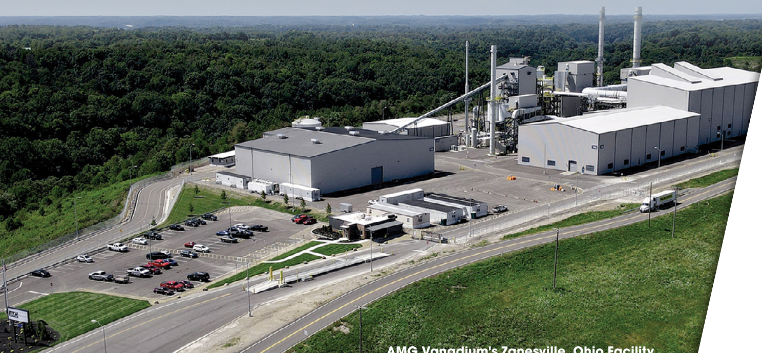
AMG Vanadium's Zanesville, Ohio Facility

AMG capitalized on this opportunity by investing $300 million in a state-of-the-art spent catalyst recycling facility in Zanesville, Ohio, which became fully operational in 2022. This facility, along with AMG’s original Cambridge, Ohio plant — established in 1952 — forms the operational