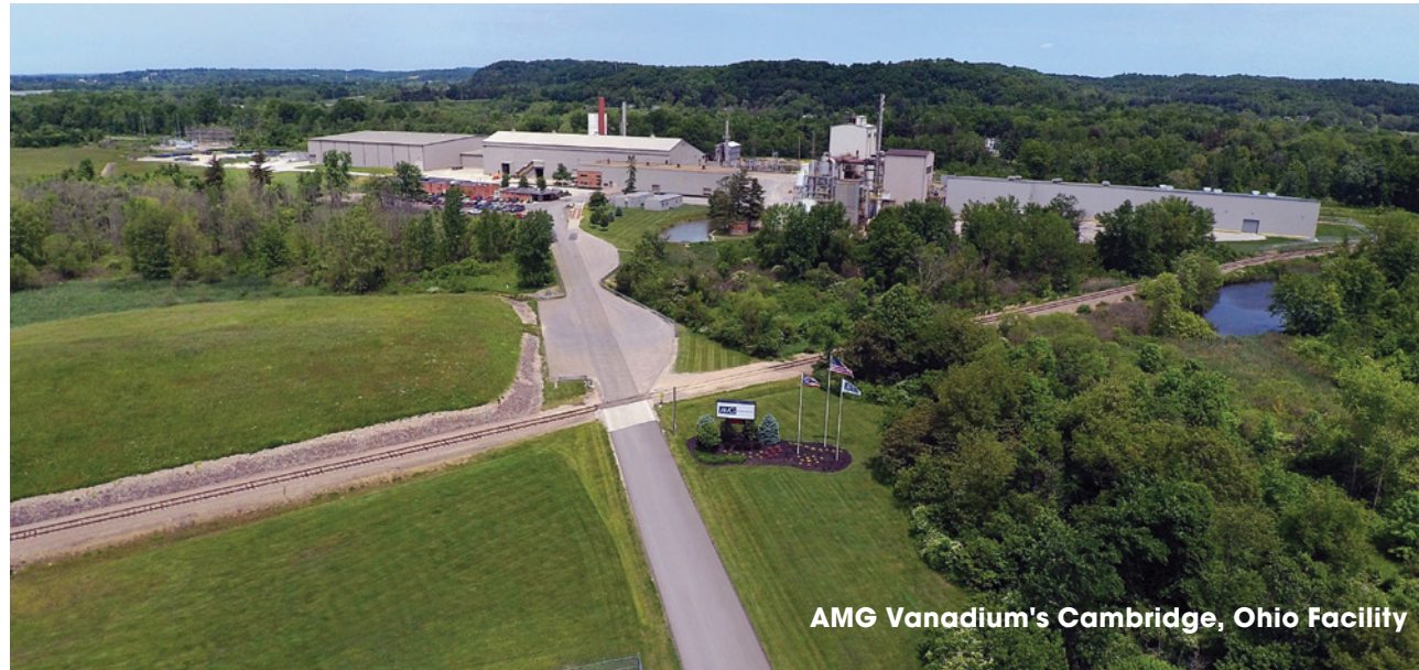
AMG Vanadium's Cambridge, Ohio Facility

designed rather than serving as the starting point.